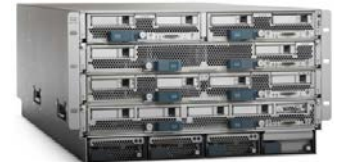
Back office hardware