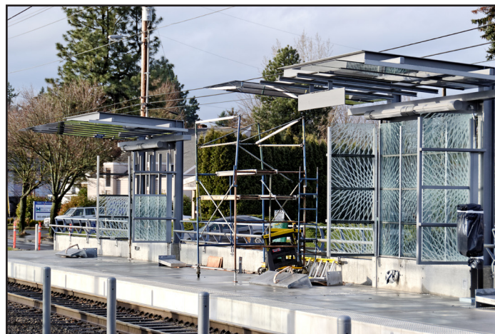
The Rockwood MAX Station has been redesigned and rebuilt as part of the Rockwood In Motion revitalization efforts within the neighborhood.

An Art Advisory Committee comprised of Rockwood representatives, artists and art professionals selected