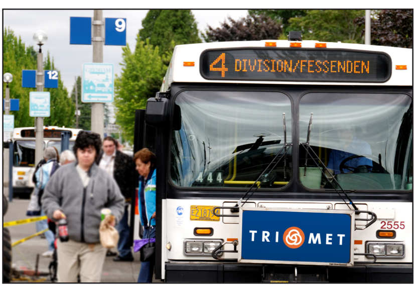
As part of our commitment to transit equity, TriMet considers every aspect of service, including placement of bus stops and shelters.

Transit equity issues occur when transportation benefits accrue to the wealthy or when transportation burdens fall disproportionately on people of color or lower income communities. Transit benefits include convenient service, amenities such as shelters, signage and benches, safe crossings, sidewalks, the quality of the fleet and fares.